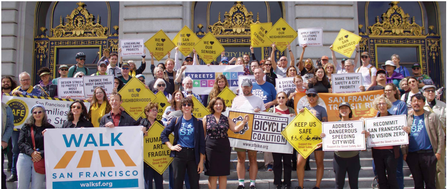
Supervisor Melgar's Street Safety Act is a blueprint for making Vision Zero a success story in San Francisco.

2025 started with San Francisco having no plan or commitment on traffic safety – plus a brand new mayor, Daniel Lurie. Despite Walk SF and the Vision Zero Coalition's efforts to get former Mayor London Breed to renew the City's Vision Zero policy before it expired in 2024, this didn't happen. What would be possible in 2025 was a big question, but there was no question that we would continue championing Vision Zero.